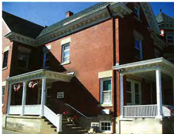
Old Jail Museum - Downtown Allegan

See next page for Heritage Tour details.