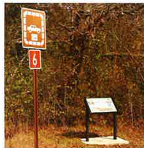
continued on page 14

The Allegan County Heritage Trail guidebook has photos and descriptions, while a two-disc audio CD set includes