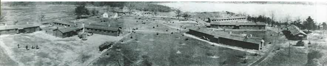
Allegan POW camp

Today, visitors can reach the foundations through the meadow with plants such as lilacs that were planted by the former occupants. The quiet