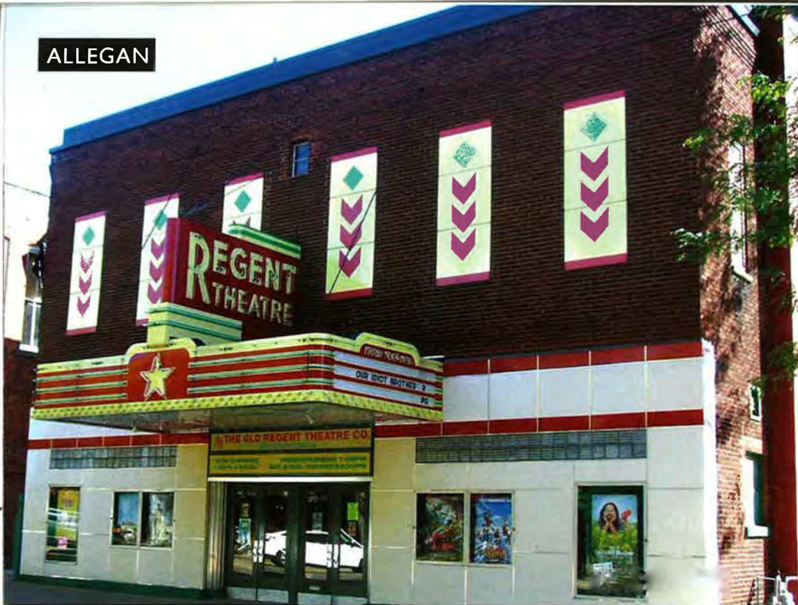
Regent Theatre - Downtown Allegan